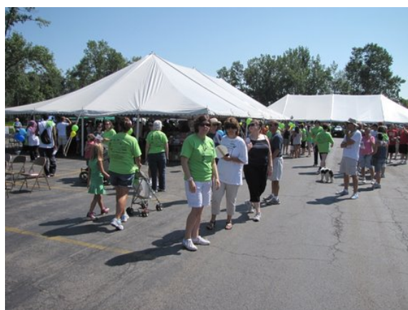
Walk Off Hunger