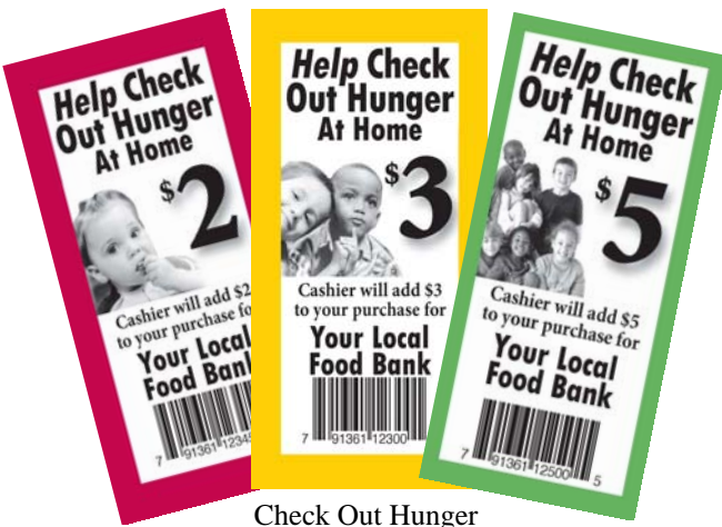
Check Out Hunger