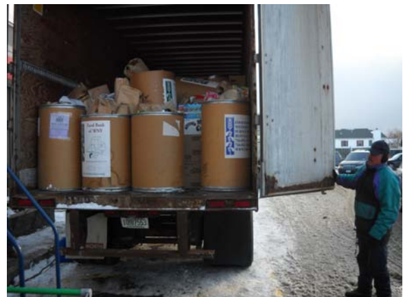
Food 2 Families